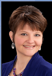
Dia Orear Oncology